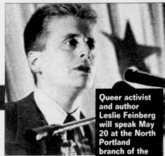
Queer activist and author Leslie Feinberg will speak May 20 at the North Portland branch of the Multnomah County Library

Young Men's Discussion Group meets from 7-9 pm. (503-223-5907, ext. 233.)