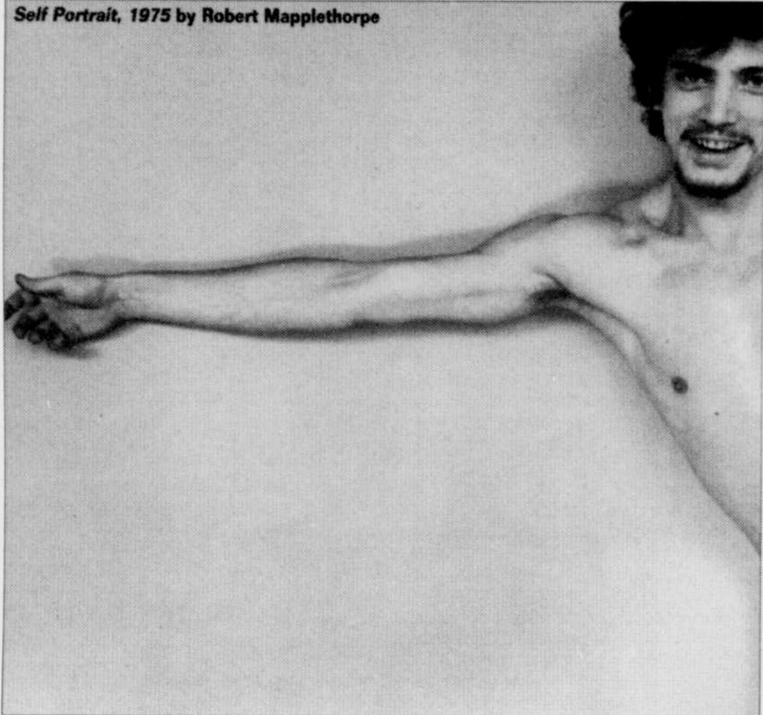
Self Portrait, 1975 by Robert Mapplethorpe

Turn your television dial to Showtime on May 27 for the premiere of Dirty Pictures , the story of the obscenity trial about the exhibition of Robert Mapplethorpe's photographs