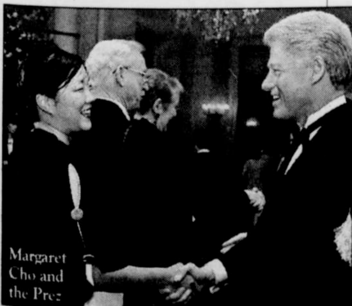
Margaret Cho and the Prez

I'm actually somewhat involved in the anti-March movement myself, because I'm going to be marching with the Freak March. I'm not actually marching in the Millennium March, although I'm going to be speaking at the Millennium March, which is great. But I'm marching in the Freak March, which is the leather,