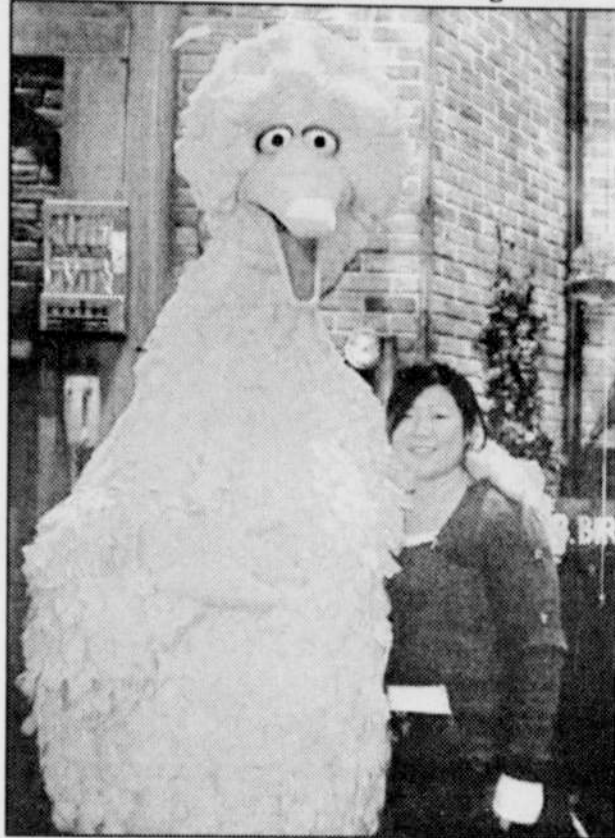
Margaret Cho and childhood idol Big Bird

polyamory, freaky, wild, sex deviant march. That's where my head is at—I'm really into that. I want to walk with the leather daddies and the bears, the people that I really connect with in the gay and lesbian community. I'm there representing Slut Pride, which is my own movement. I think it's going to be a really fun weekend; it's so volatile, all the stuff that's happening. I'm having my own sort of anti-March thing, but yet still being totally