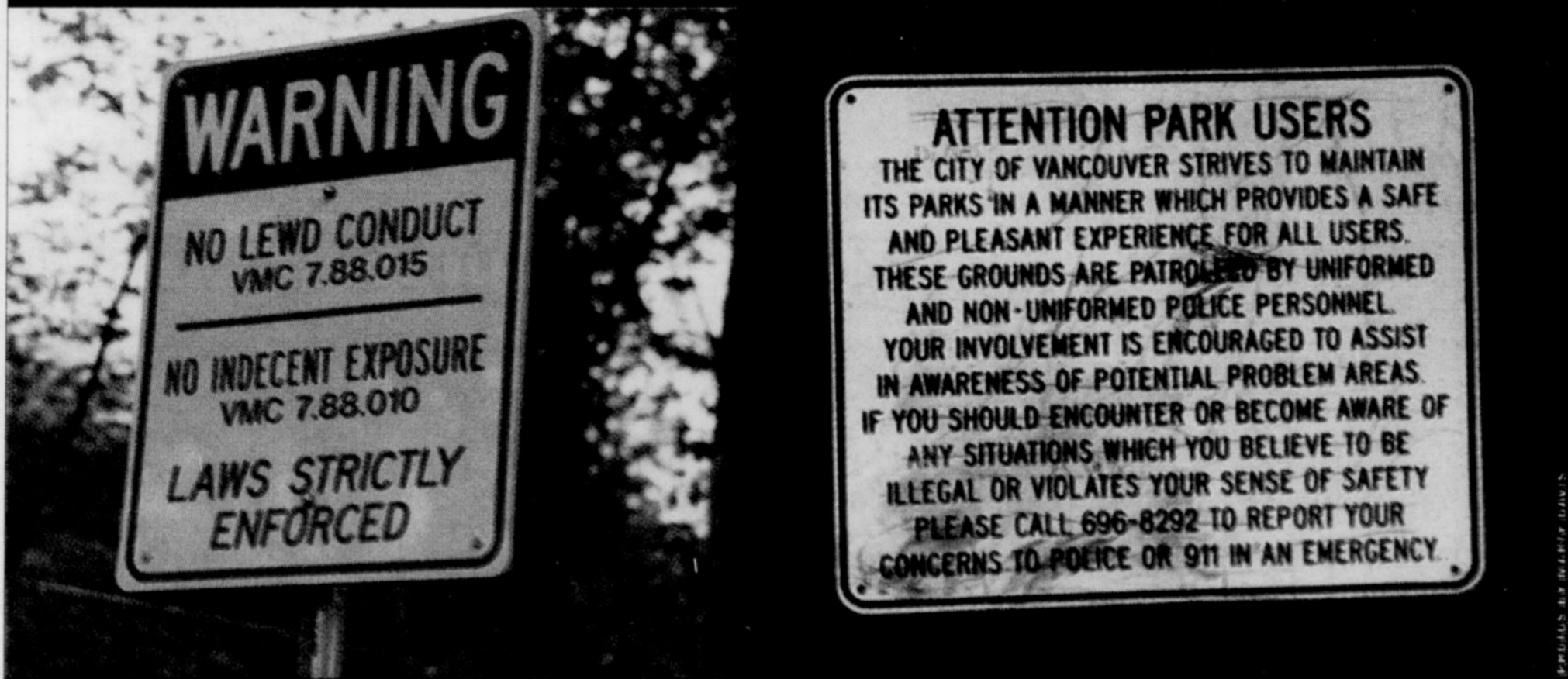
Toto, I don't think we're at Rooster Rock anymore. (These photos were taken at Winter Park in Clark County, Wash.)