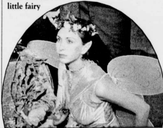
Lava de Mure's little fairy

marimba and more. Even the costume-impaired can come as they are and have their face, or whatever, painted at the party.