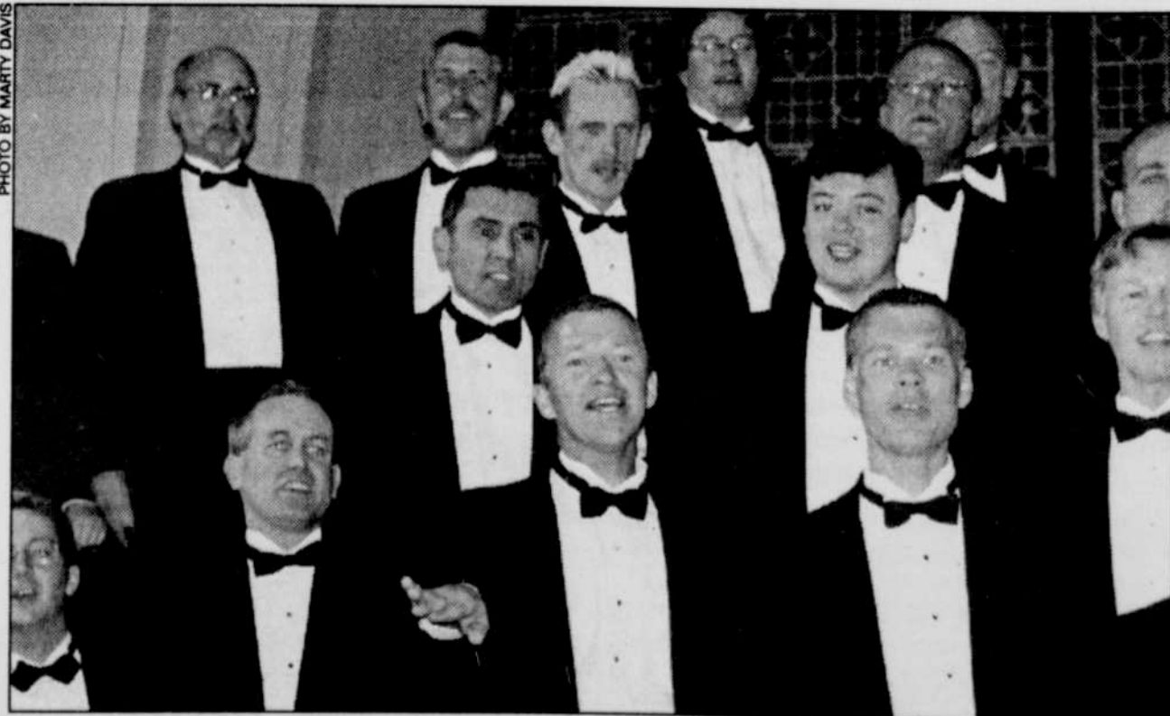
A class act: The Portland Gay Men's Chorus performs Feb. 25