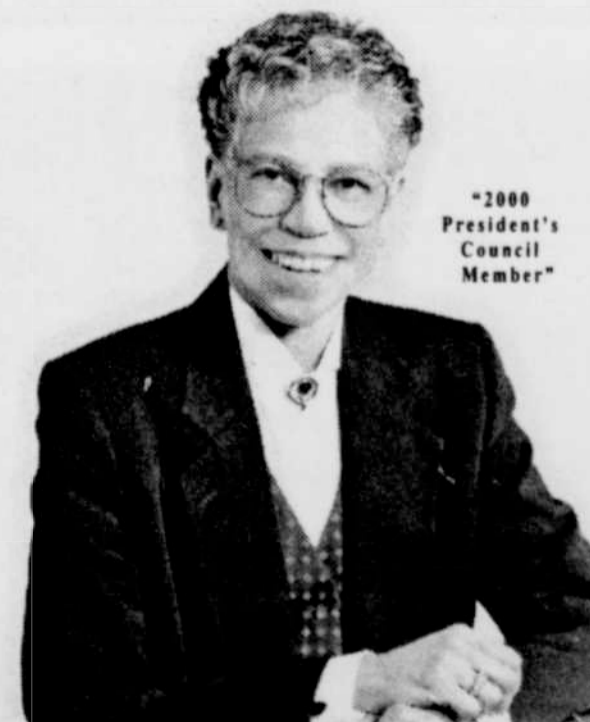
"2000 President's Council Member"

800.487.6626 Voicemail: 503.291.7713 500 N.E. Multnomah, Suite 278, Portland, OR 97232 www.waddell.com www.floreidwalker.com Member SIPC