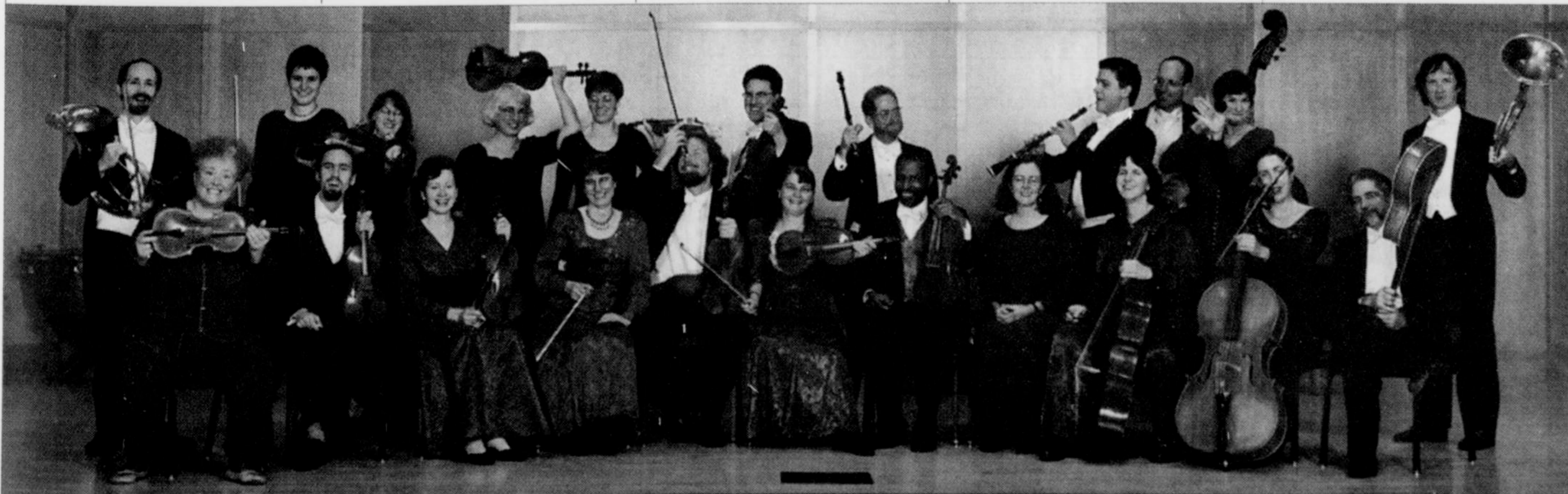
The Portland Baroque Orchestra has a light-hearted moment before they get serious; they perform a Handel's Messiah for the Millennium through Dec. 20, at Trinity Episcopal Cathedral.

See On View and Onstage listings on Page 33.