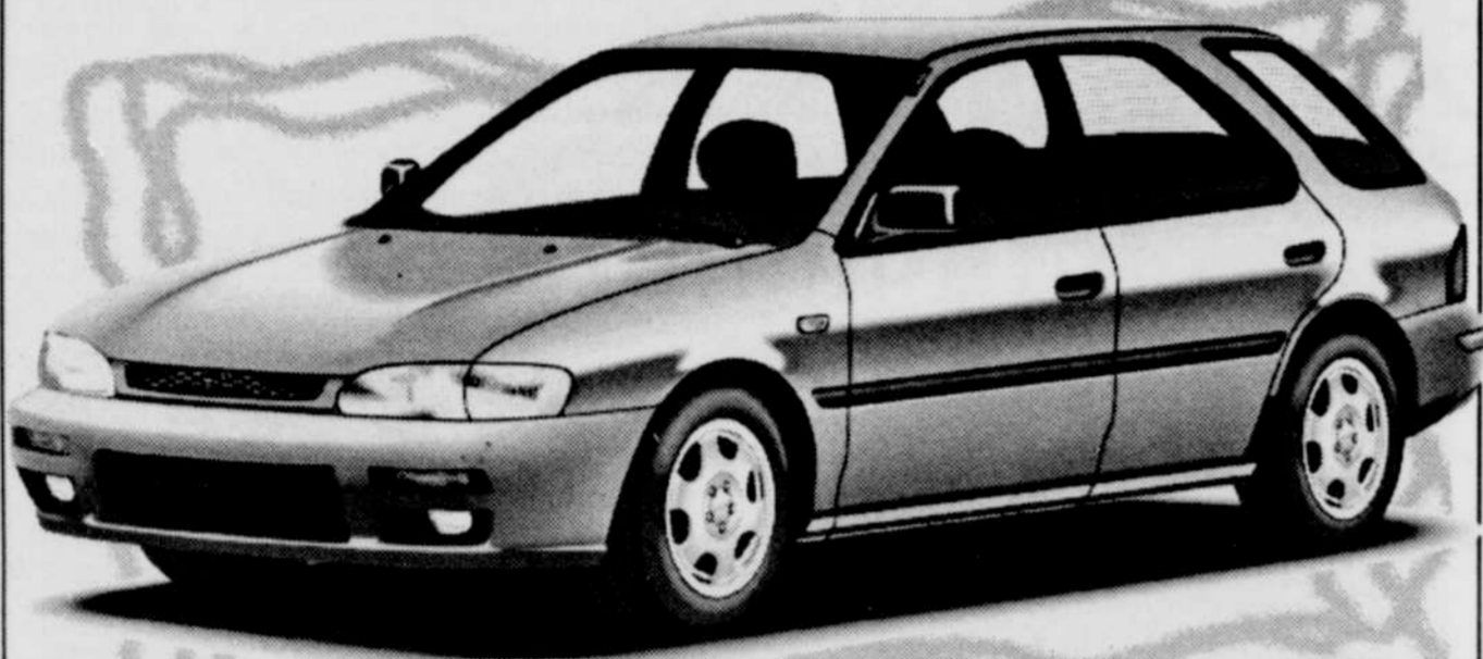
'99 Impreza Wagon

IN THIS WAGON, THE ONLY THING YOU WON'T BE ABLE TO CONTAIN IS YOUR EXCITEMENT.