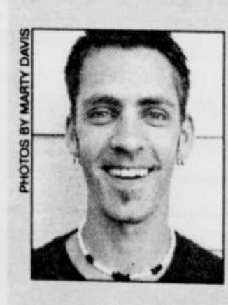
Eugene Student "It's a great word,

The question for this issue: "How do you feel about the word queer?"