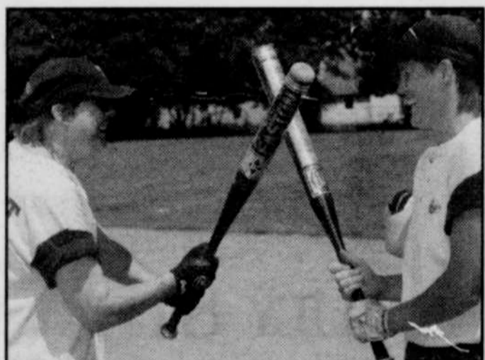
Battling bats of the RCSA

Beginning this year, the regional softball tournament, which has been held exclusively in Seattle since its inception 18 years ago, will spend alternating years in Portland.