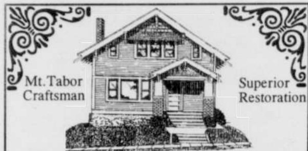
Mt. Tabor Craftsman Superior Restoration

$285,000—COMPLETE PRIVACY. 3,200 sq. ft. home on 5 acres—perfect place for group living, home business or craftsman's workshop. Main house: 5 bedrooms and 3 baths. Plus: shop, steel pole barn, 2 cottages, bungalow, 16x32 studio. 1720 Brower Rd. in Corbett, 1/2 hr. east of Portland. Call Laren (503) 805-5839 or e-mail zendust@ibm.net. (6/18)