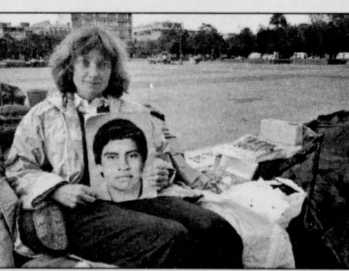
The Northwest Film Center screens Dirty Secrets, part of a series on international women directors, through July 6

Fifth annual gay and lesbian meditation retreat takes place Aug. 13-18 at Cloud Mountain Retreat Center. $250 for food and lodging, plus personal donation to teachers. (Friend of Cloud Mountain, Cloud Mountain Retreat Center, 373 Agren Road, Castle Rock, WA 98611. Greg Smoots [503] 727-3575.) (7/2)