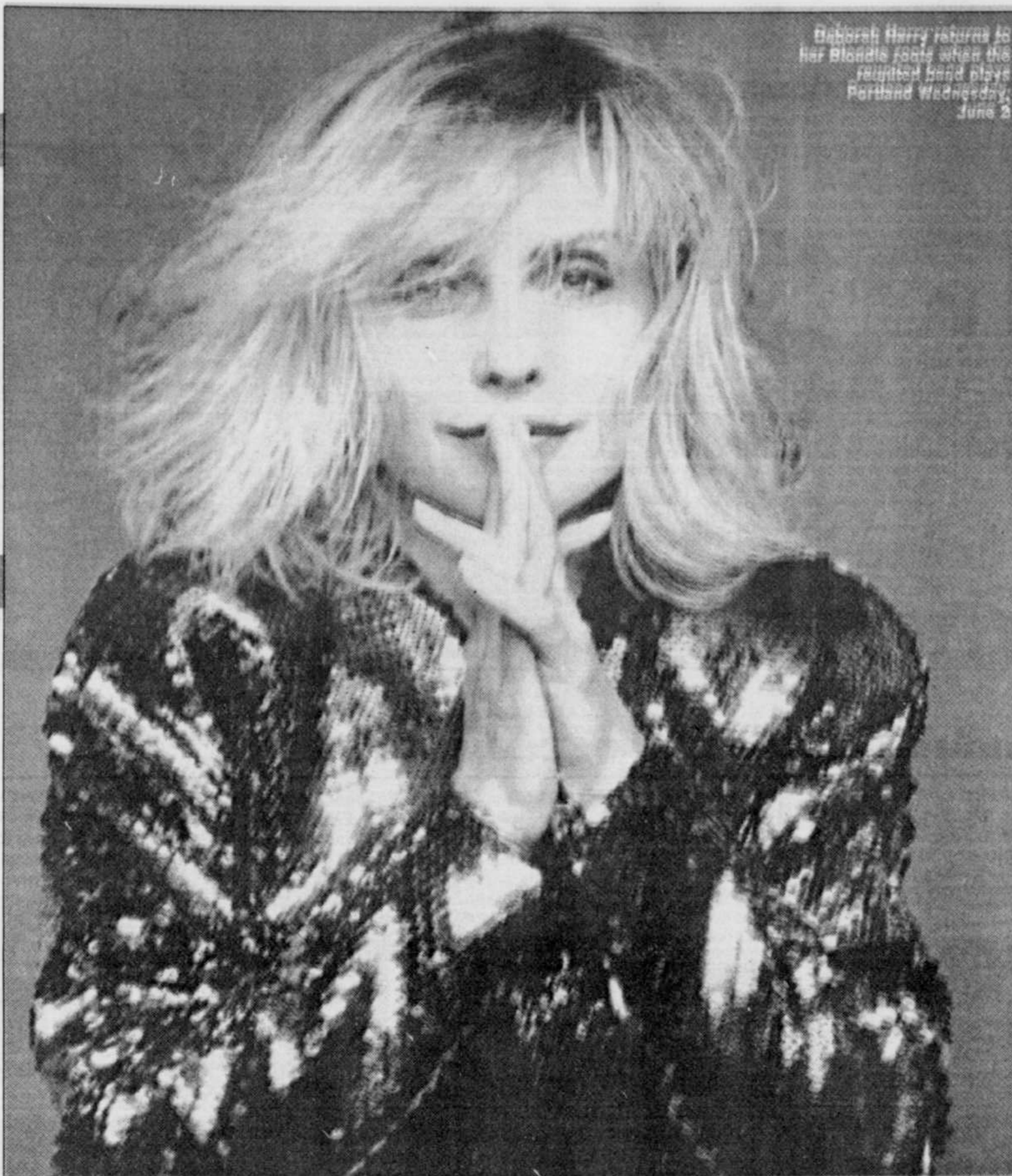
Blondie Harry returns to her blonde roots when the reunited band plays Portland Wednesday, June 2

Members of Portland Bisexual Alliance, the Bisexual Community Forum, and Portland Bisexual Women discuss how to make Pride '99 bi-positive with representatives from Pride Northwest. Open to all. (7 pm at