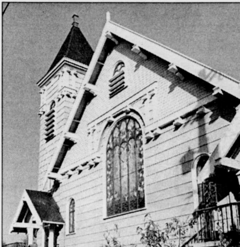
Metropolitan Community Church of Portland

☺ Portland hosts the fifth annual PFLAG convention. Workshop topics range from