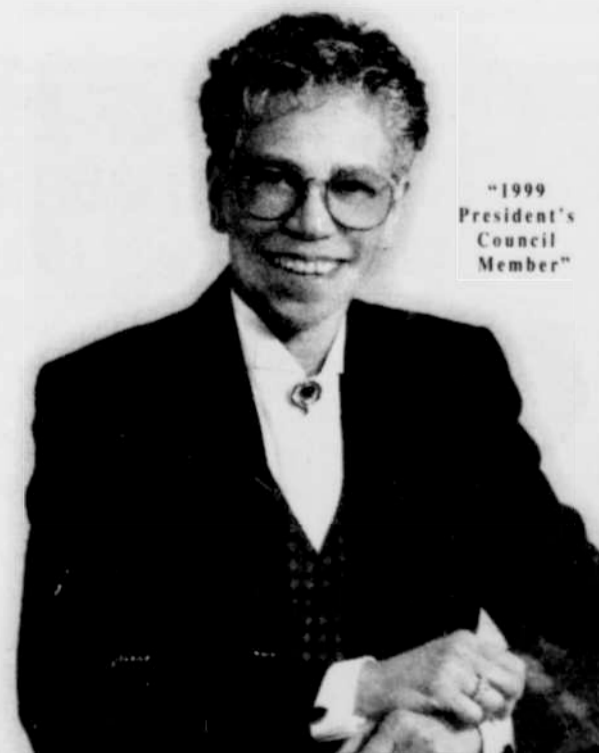
"1999 President's Council Member"

Retirement Plans • Mutual Funds • College Planning