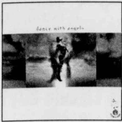
DANCE WITH ANGELS Various artists • Centaur Entertainment

This latest release from Centaur is the seventh in a line of dance compilations devoted to promoting AIDS awareness. Dance with Angels includes an unlikely group of celebrated artists and musicians such as Gloria Estefan, Sting, Aretha Franklin, Janet Jackson and Barry Manilow, among other notables.