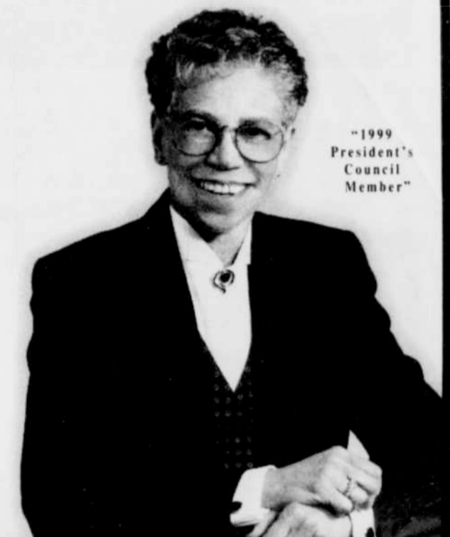
1999 President's Council Member

Retirement Plans • Mutual Funds • College Planning