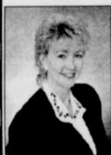
Sr. Mortgage Loan Officer

4201 NE 66th Ave., Suite 101 Vancouver, WA 98661