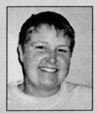
community with a variety of needs."