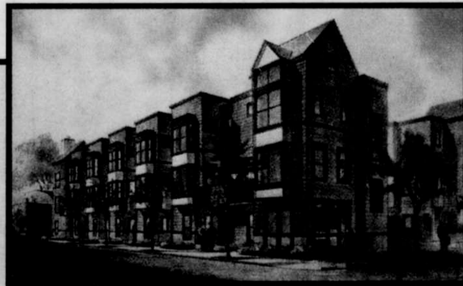
2-3 bedrooms starting at just $189,950