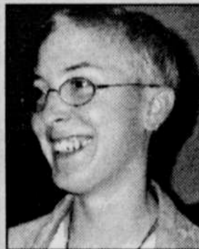
ANALISA Portland Student

"It's very liberating and it makes life positive and joyful. It brings you in touch with who you are."