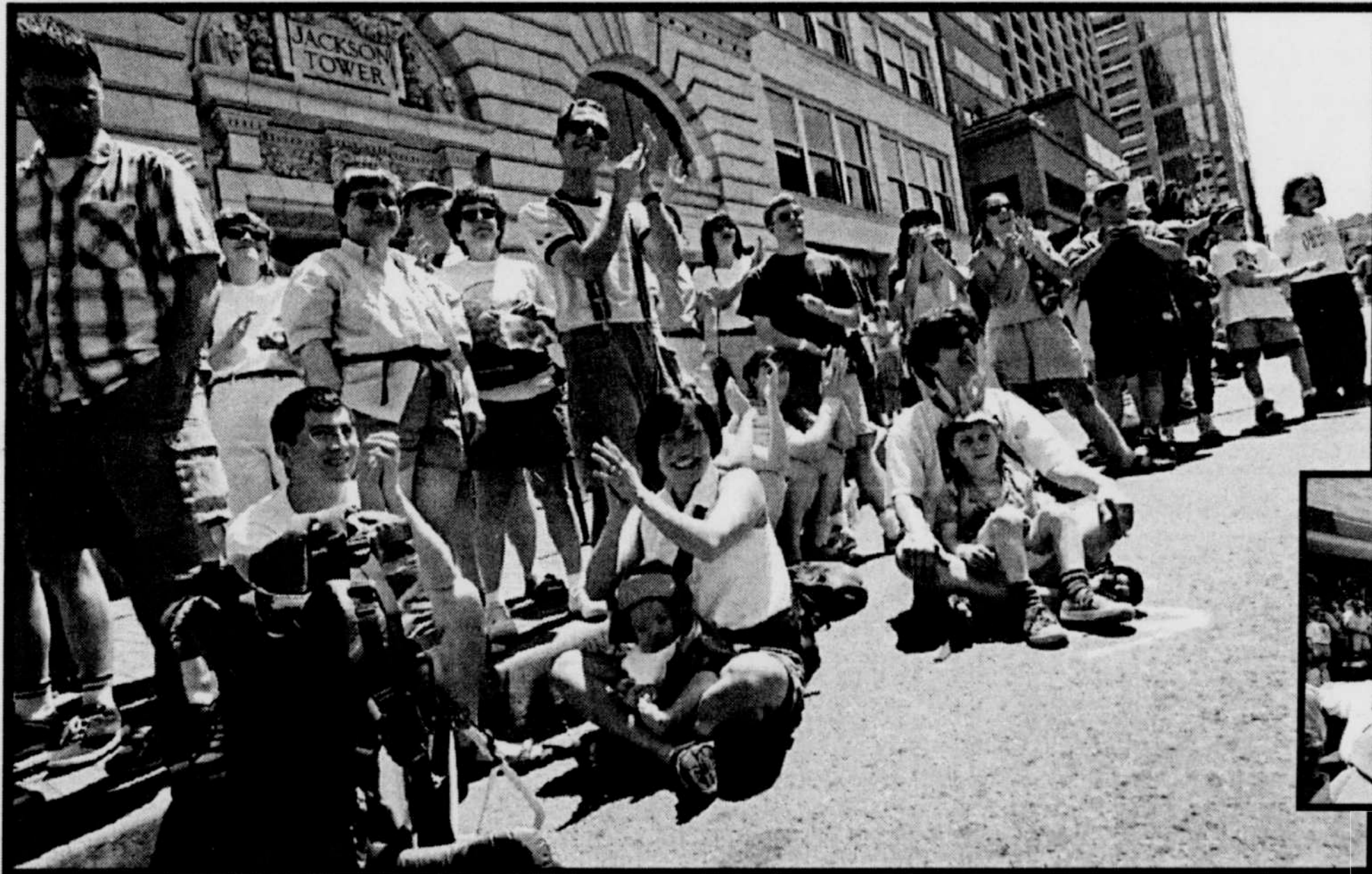
Below left: Northwest Gender Alliance; below right: Neveh Shalom enjoy their first pride parade