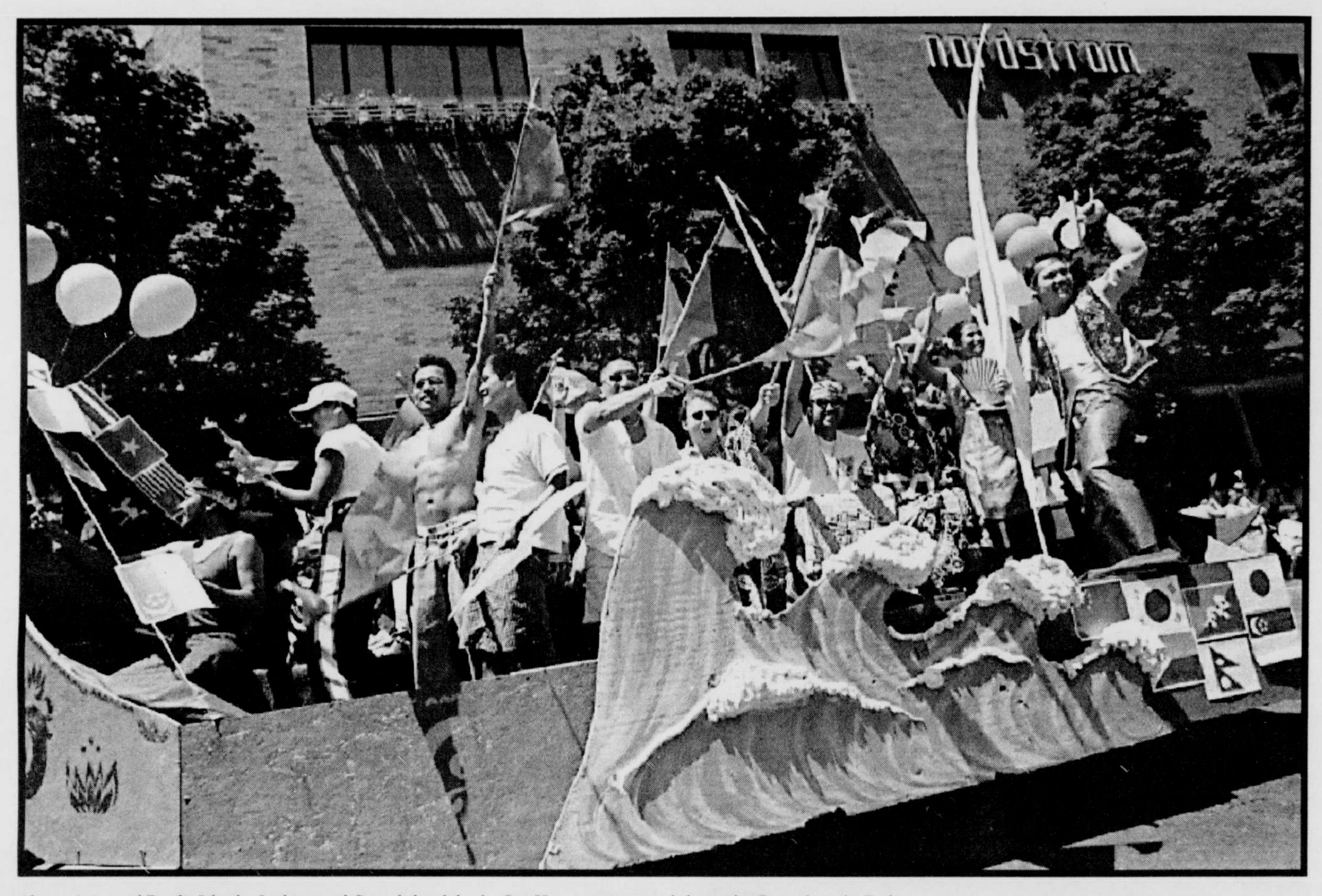
Above: Asian and Pacific Islander Lesbians and Gays; below left: the Our House contingent; below right: Peacock in the Park