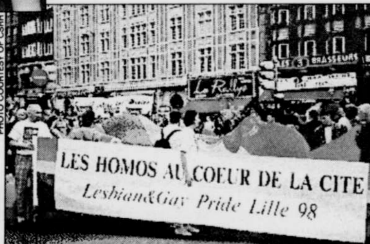
"Gays in the heart of the city"

An estimated 2,000 people turned out for the third annual gay pride march June 13 in Lille.