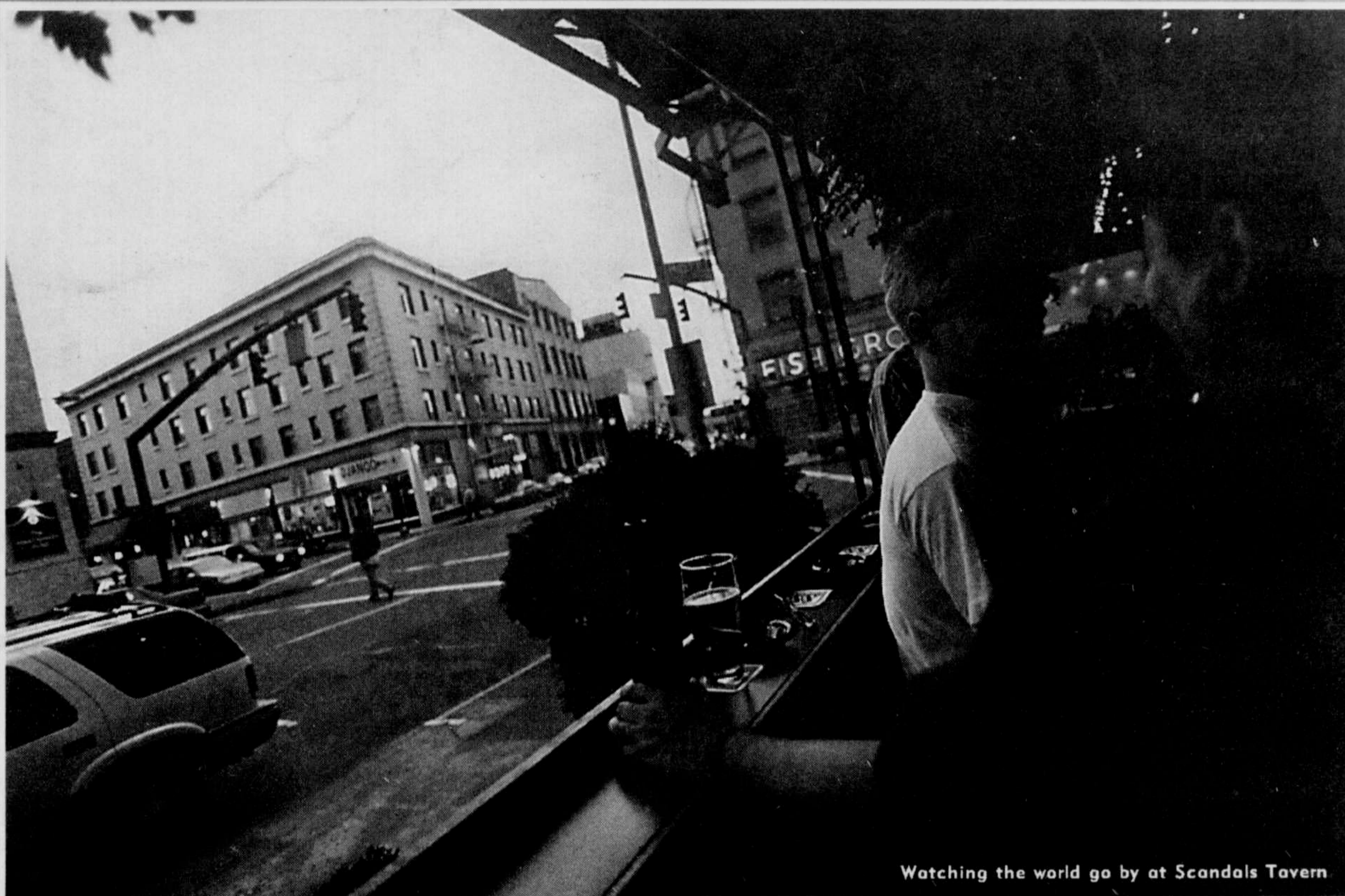
Watching the world go by at Scandals Tavern