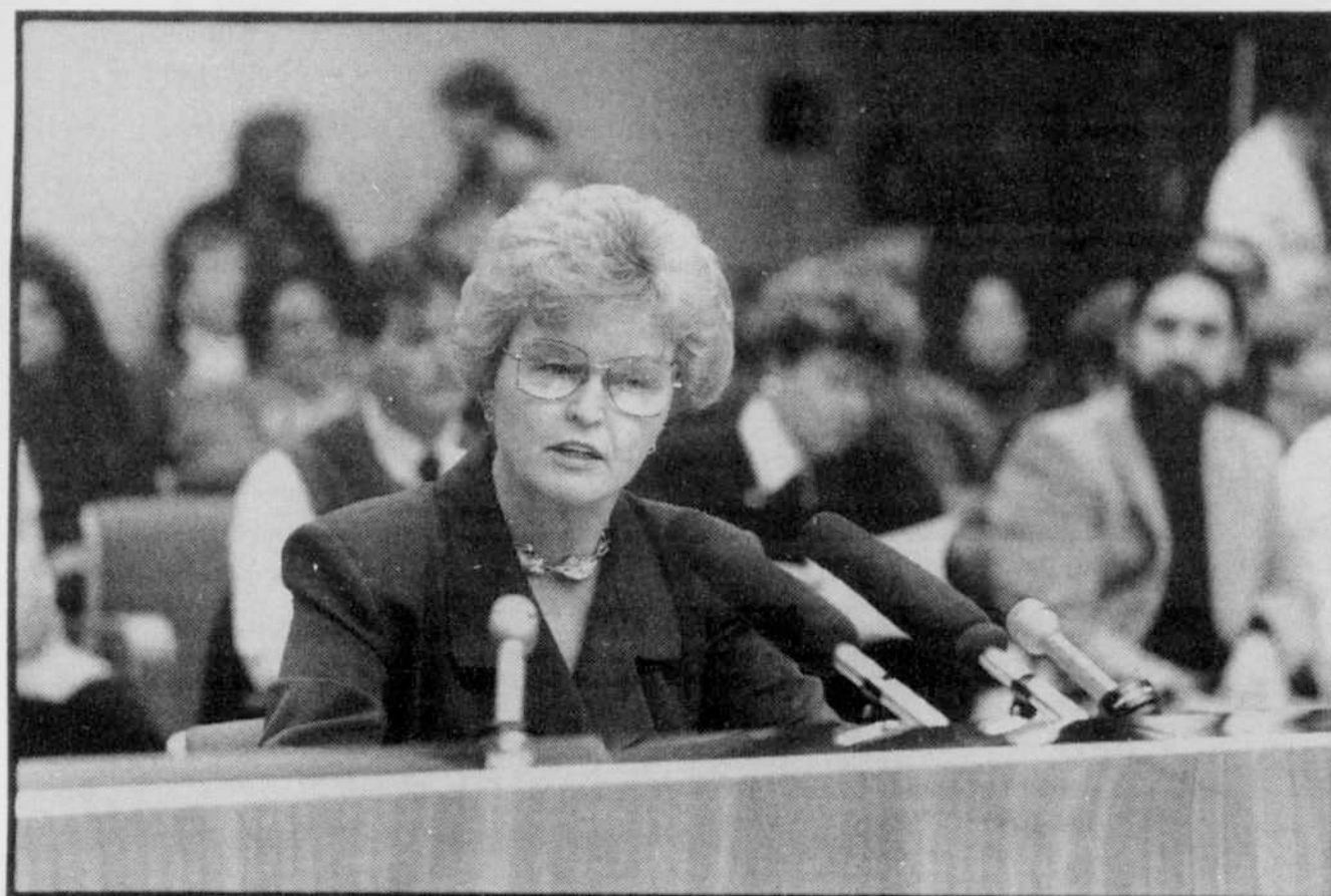
Former Gov. Barbara Roberts in 1991