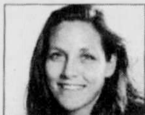
Katy Steding Olympic Gold Medalist 1996