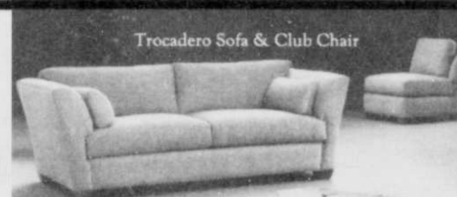
Trocadero Sofa & Club Chair

Delivery available ~ 90 days same as cash