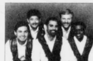
A Capella Vocalists From Top to Bottom

For More Information Call RTP at (503) 228-5825