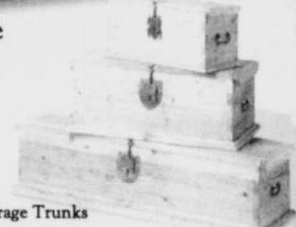
Rustic Storage Trunks

Portland 1916 NE Broadway 10-7:30 Mon-Sat & 12-5 Sun 335-0758 Beaverton 11345 SW Canyon Road 10-6 Mon-Sat & 12-5 Sun 626-0400