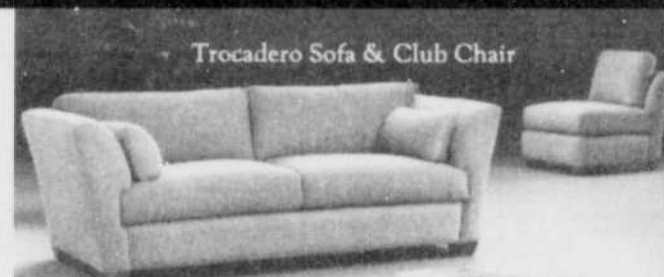
Trocadero Sofa & Club Chair

Delivery available ~ 90 days same as cash