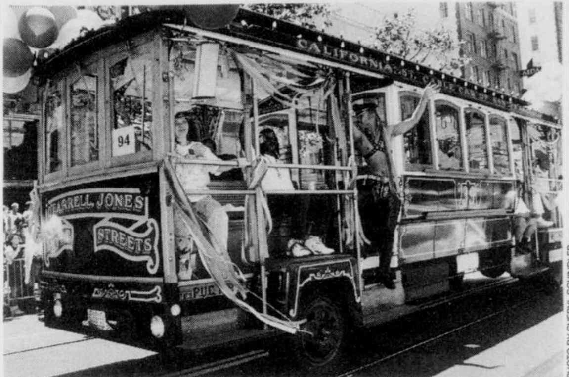
San Francisco Pride will expand to two days this year