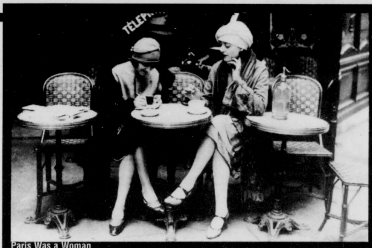
Paris Was a Woman

FAITHFUL : A miserable Cher walks up to a gay couple who are admiring a Rolls