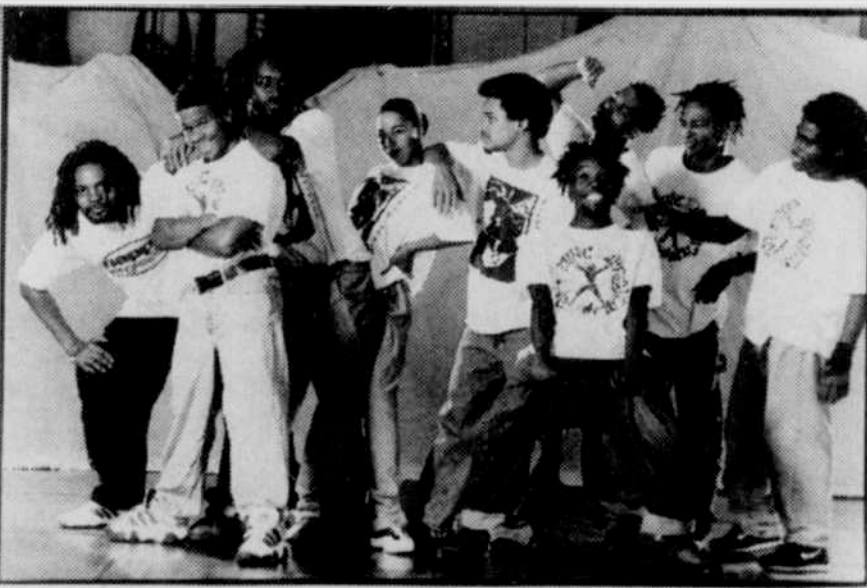
Rennie Harris Pure Movement dance ensemble