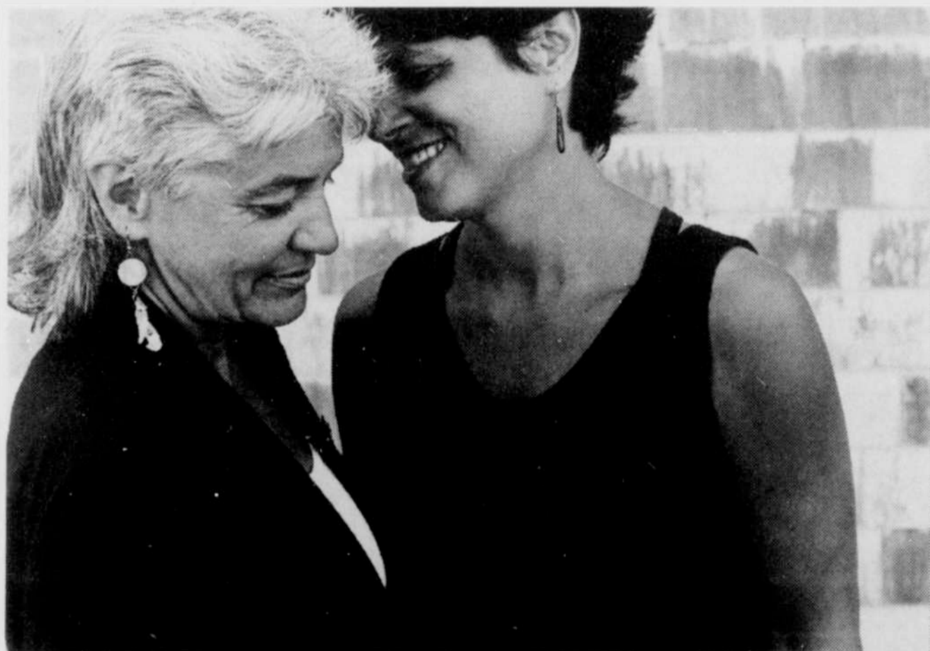
Cris Williamson and Tret Fure

Not surprisingly, it was their professional passions that initially brought Fure and Williamson together when, in 1981, Fure engineered a children's record for Williamson.