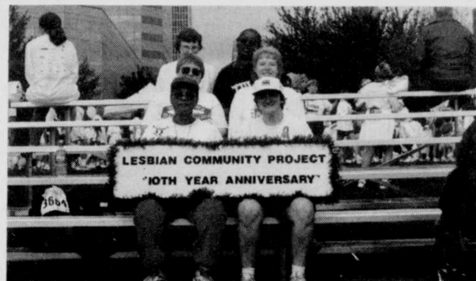
LCP's Race for the Cure team

It marked the first time LCP sponsored a team in that event, which is designed to raise money for breast cancer research. Team members wore LCP logos in the 5 kilometer walk, and two members carried an LCP banner.