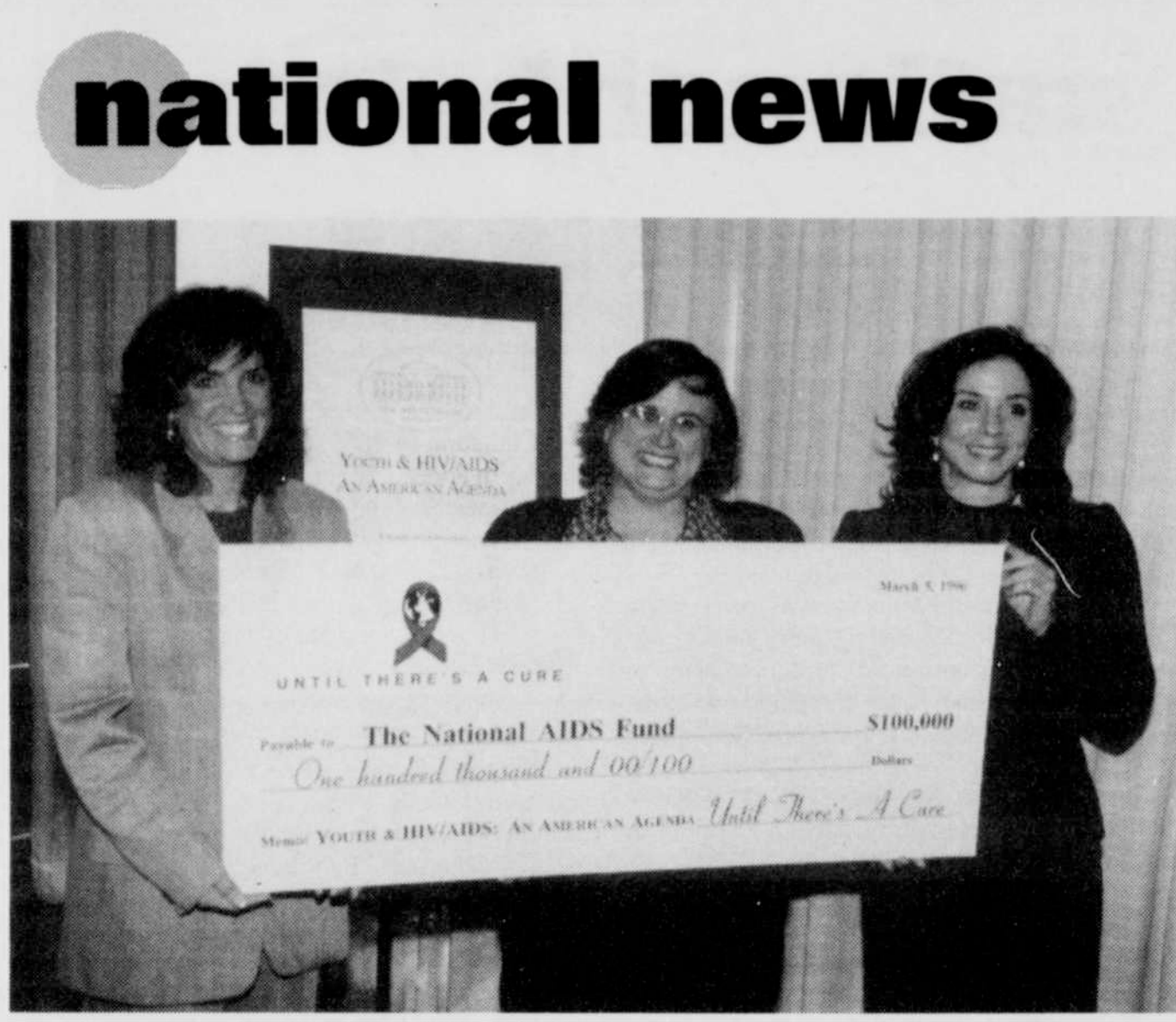
Check presentation to the National AIDS Fund