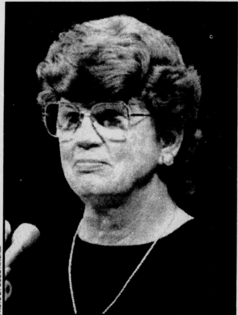
Attorney General Janet Reno

According to published reports, at least four other couples have been found murdered on federal park land in