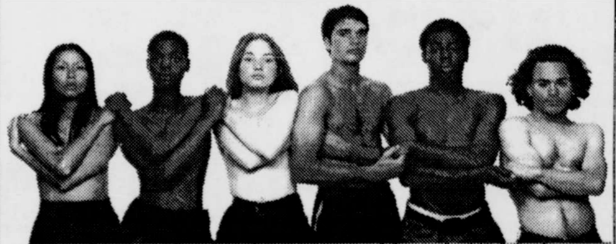
Speak to Your Brothers is a program of Cascade AIDS Project

MenTalks • Volunteering • Outreach HIV Testing • Speaking of Sex... 503-223-5907