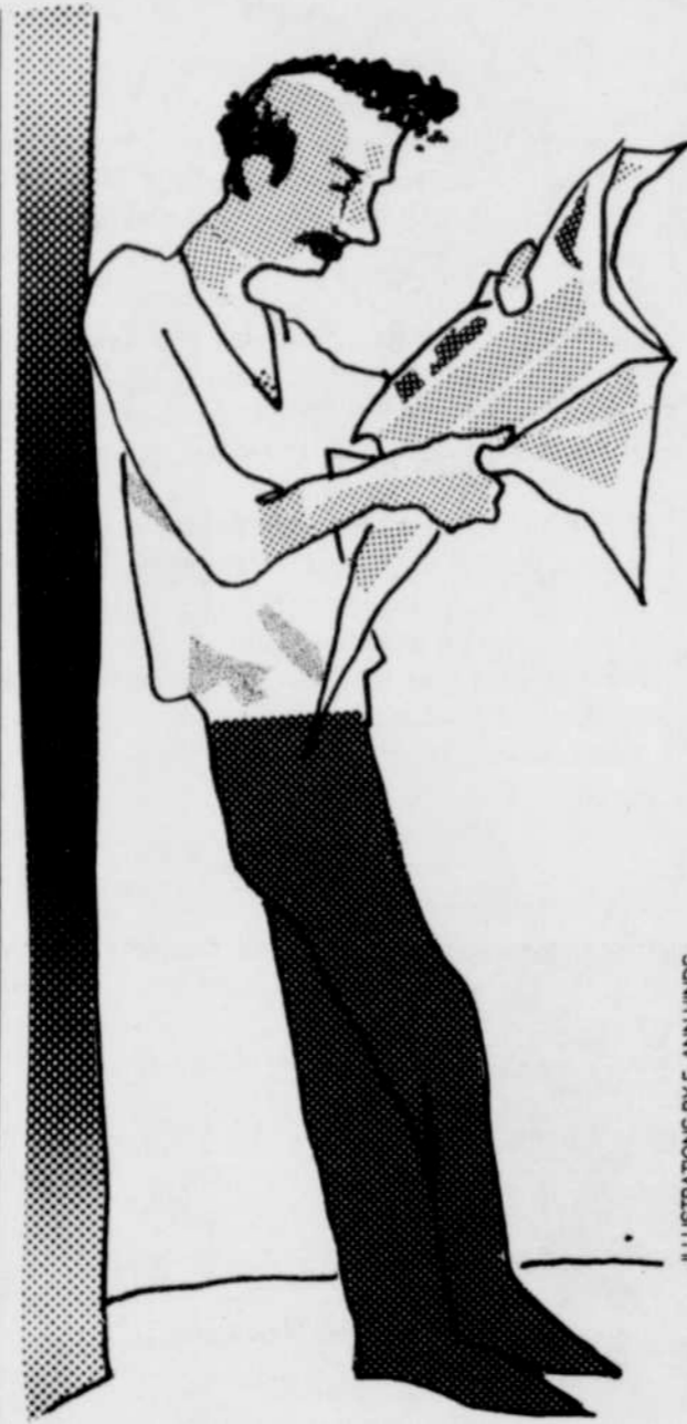
ILLUSTRATIONS BY ANN HINDS

Stop white-male bashing! Tired of your constant coverage of "politically correct minorities." Too left-leaning—need more balance.