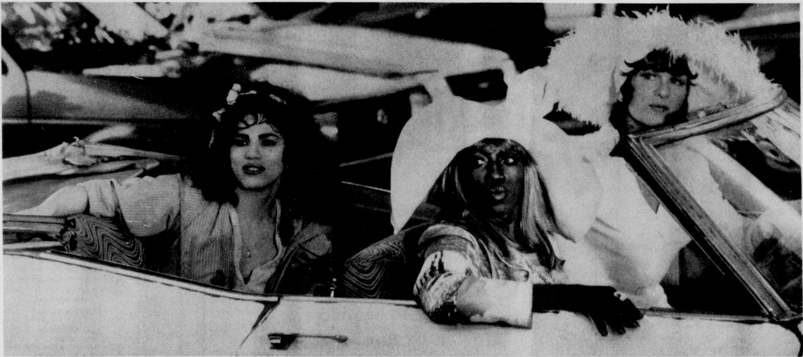
From left: John Leguizamo as Chi Chi, Wesley Snipes as Noxeema and Patrick Swayze as Vida