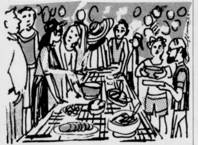
members, friends and families. The public is welcome to attend.

Seventh-day Adventist Kinship International will hold its 16th annual Kampmeeting from Aug. 20 to 27 near Portland. The Kampmeeting is a spiritual, social and fellowship retreat for Kinship