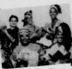
ASE Drumming Circle