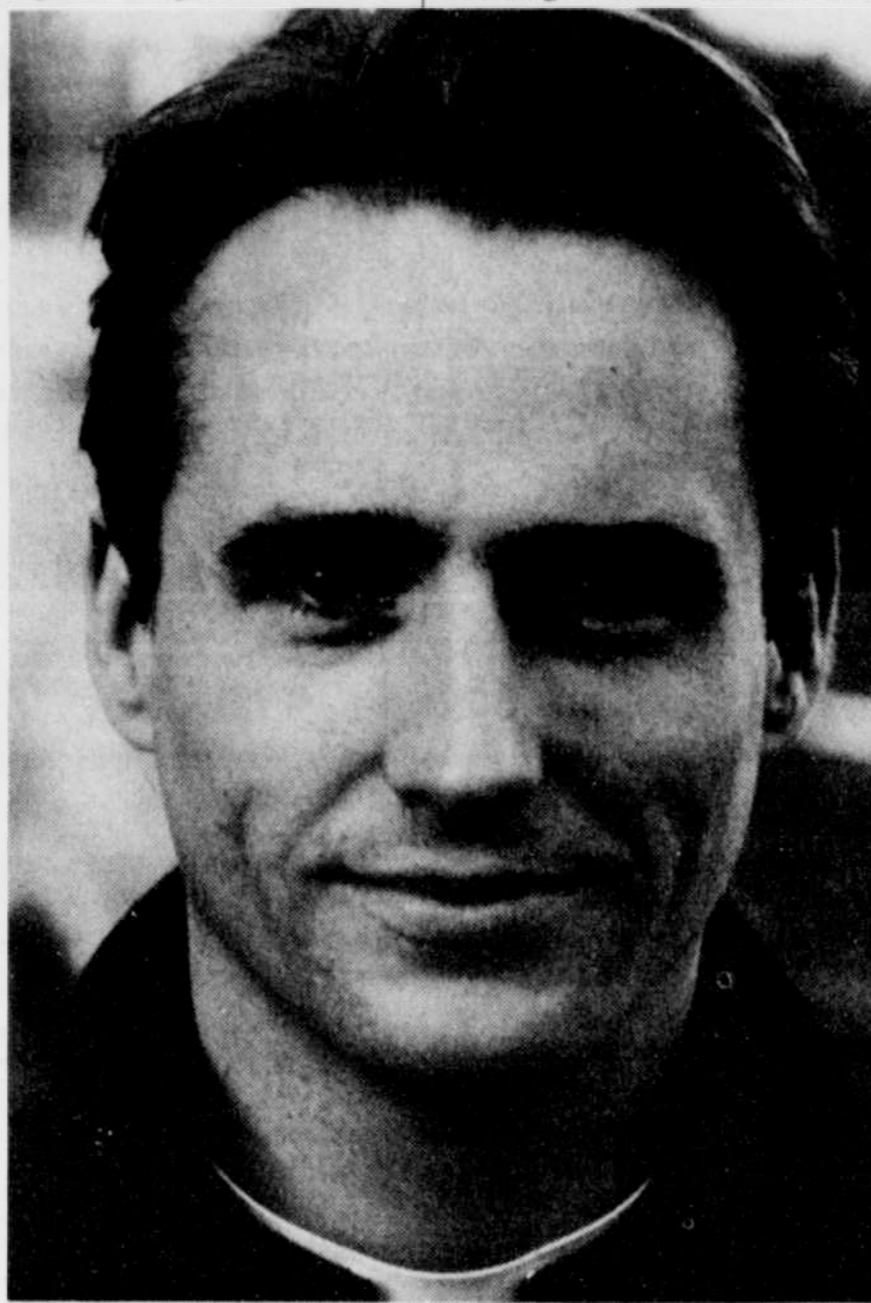
Priest star Linus Roache