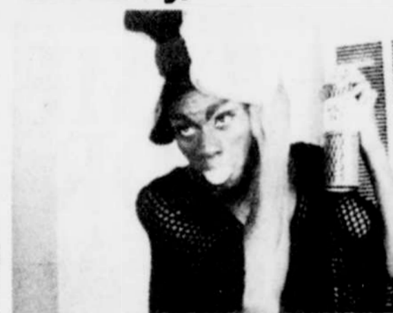
From Days Of Pentecost, USA 1995 US Premiere