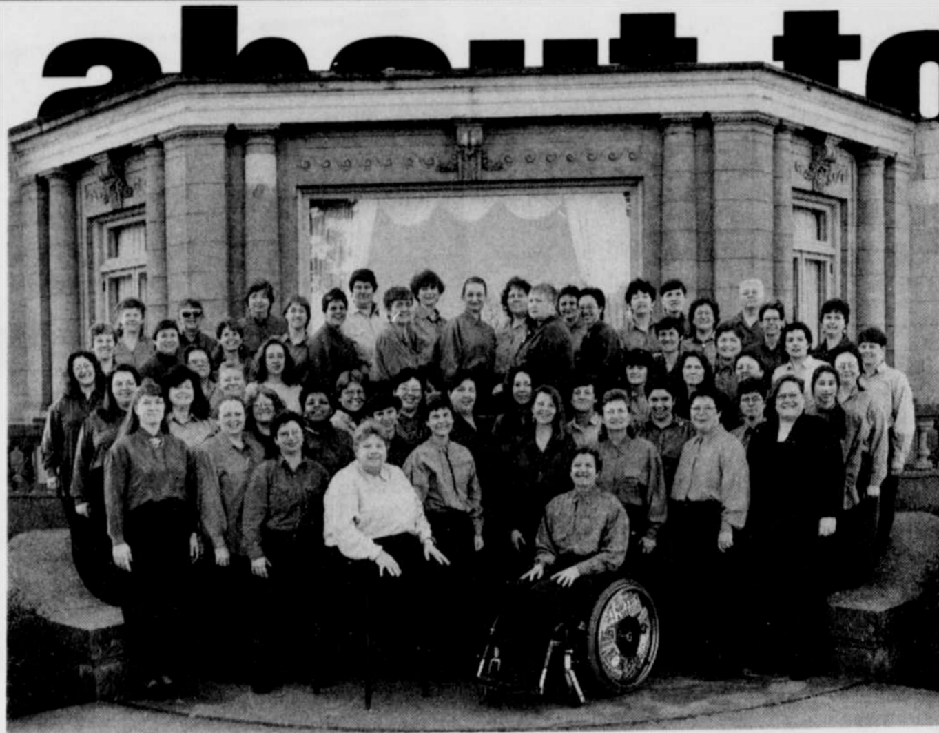
The Portland Lesbian Choir is part of the Pacific Northwest Women's Choral Tour, which will perform Under One Sky in Portland on May 6

Tri-Met celebrates the 25th anniversary of Earth Day by waiving fares for all trips, all day.