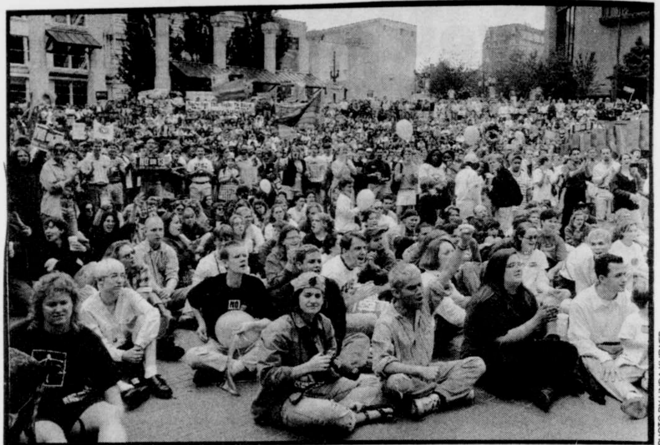
No on 13 supporters thronged Pioneer Courthouse Square, Oct. 9