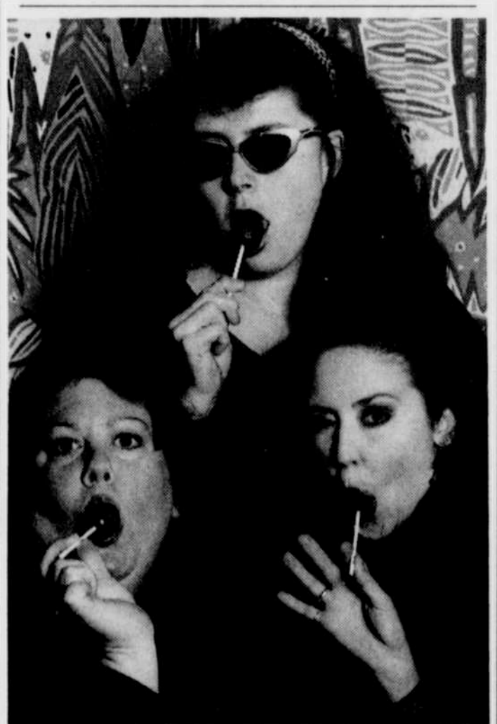
Raging Hormones, an improv comedy group, starts its last run Aug. 19