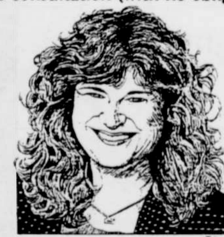
"I start by listening."

~ Specializing in classic and restorable homes in Portland's established neighborhoods ~