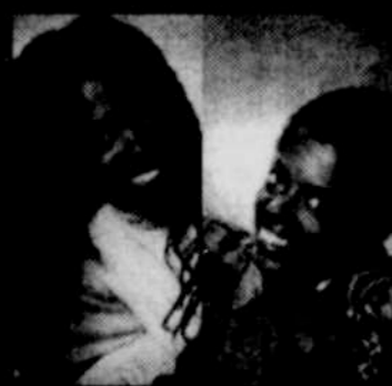
THE WASHINGTON SISTERS