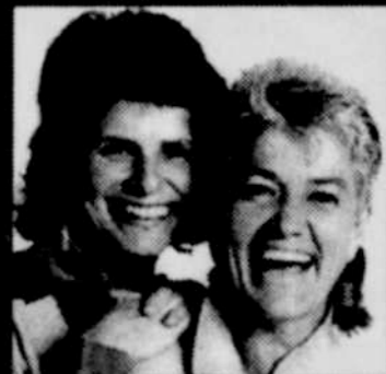
CRIS WILLIAMSON & TRET FURE